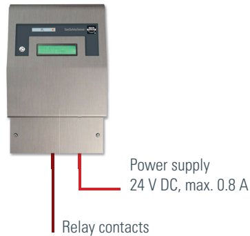
III. 3: Autonomous connection as single Monitor