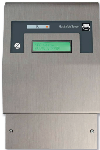
III. 1: GasSafetySensor with LCD display

The warning and alarm levels of each Sensor can be freely configured. If the default setting is to be changed this can be done either via the connected GasSafetyMonitor or via a web server.